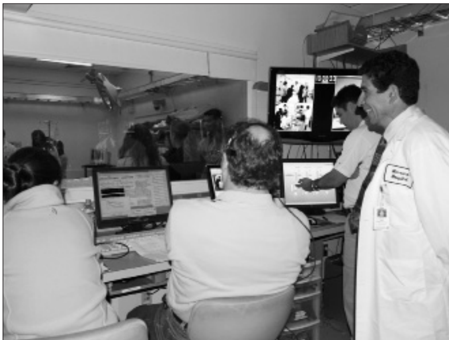
Center for Medical Simulation - View from the control room

Stratus Center for Medical Simulation, Brigham & Women's Hospital, Boston www.brighamandwomens.org/stratus