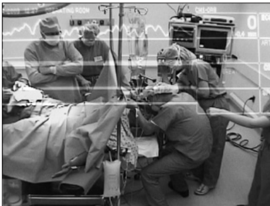
Center for Medical Simulation - Team participation in a simulation.

If these questions intrigue you, then the experience of a day at the medical simulator may be just what you're looking for.